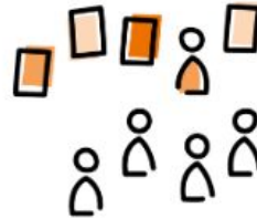
Large group gallery walks for feedback