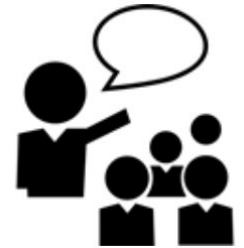
Share with large group