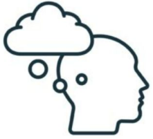
Silent generation (individual think)