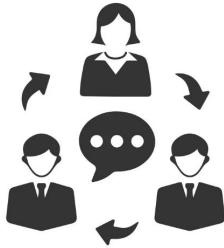
Round robin sharing (take turns to clarify ideas)