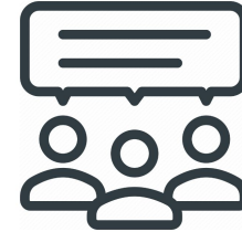
Small group incorporate feedback